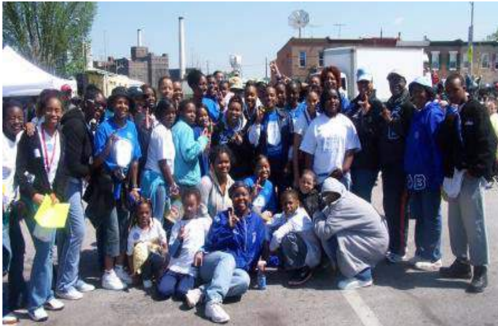
Members of Tau Eta Zeta pose with their Archonettes, Amicettes, and Pearlettes after participating in the March of Dimes Walk-a-Thon on Sunday, May 1.