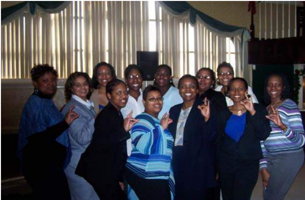
Members of Tau Eta Zeta take time to pose together during the first joint Founders Day celebration at Michael's in Glen Burnie.