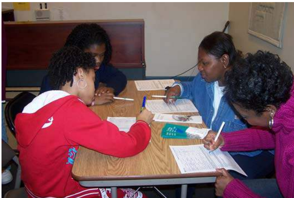
Kids from the Baltimore area start savings accounts with M&T Bank at the Madison Avenue Outreach Center as part of THZ's Z-HOPE workshop, Planning Your Legacy: Financial Planning.