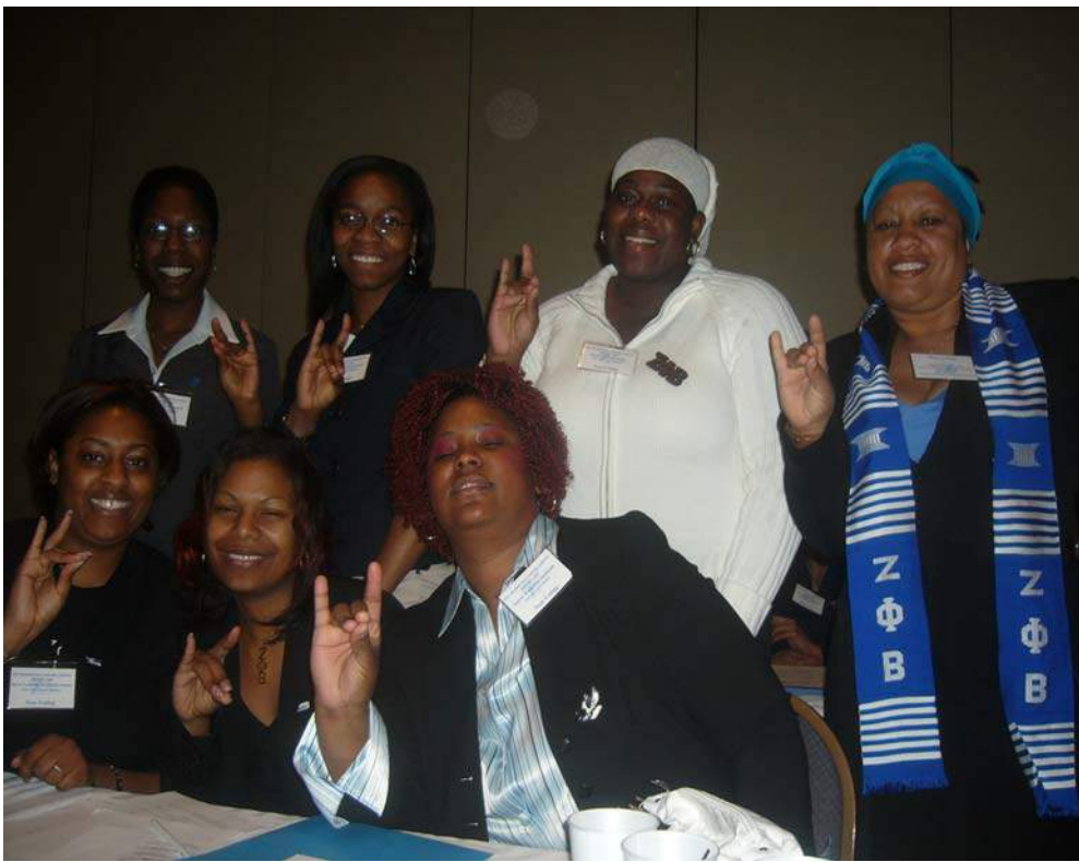
Members of Tau Eta Zeta pose together during the Maryland State Leadership Conference held in Pikesville, MD.