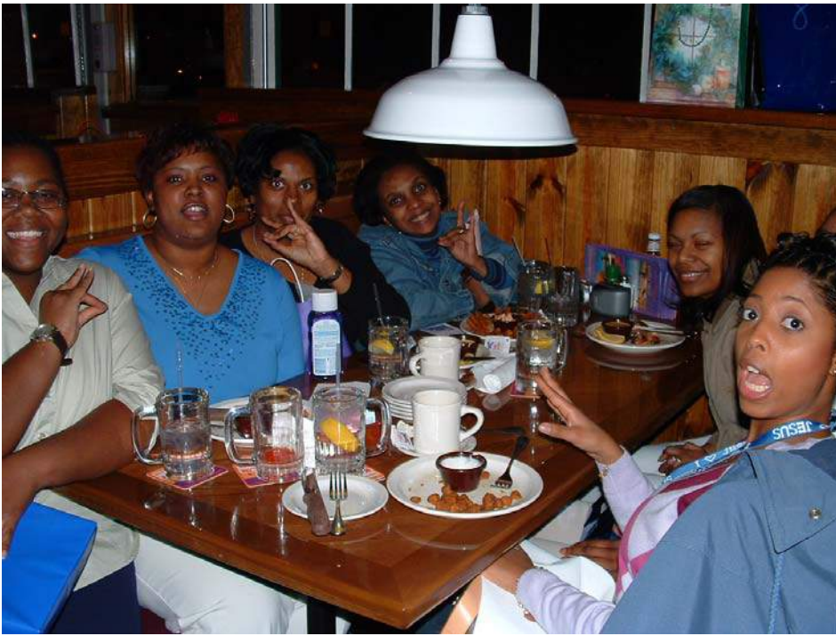
Sorors gather at Outback Steakhouse in January to celebrate Finer Womanhood Month and exchange gifts.